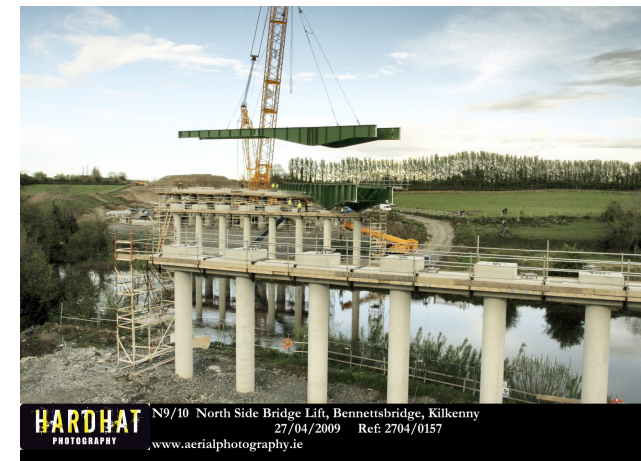
Lifting deck beams at River Nore

N9/N10 Phase 4 Knocktopher to Powerstown scheme is funded by the National Development Plan 2007-2013 and part financed by the European Union under Regional Development Fund