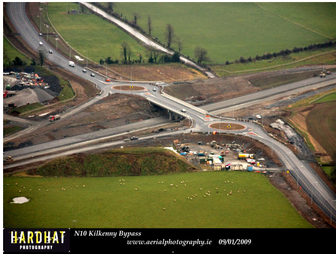
Danesfort interchange on existing N10