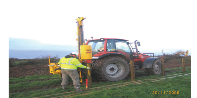
Fencing at Longfordpass