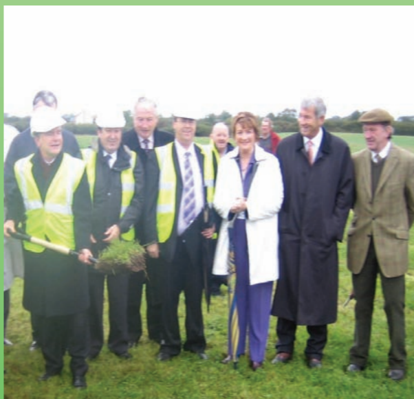
Minister for Transport Martin Cullen TD turns the sod at the official ceremony held in October 2006 at Two Mile Borris, Thurles, County Tipperary.

M8/N8 Cullahill to Cashel Road Improvement Scheme is funded by the National Development Plan 2007-2013 and part-funded by the European Union under Trans European Transport Infrastructure Networks (TEN-T)