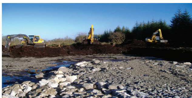
Soft Ground Excavation at Ballytarsna

Kilkenny County Council and SRB will have continuous liaison with landowners and members of the public during the course of the project.