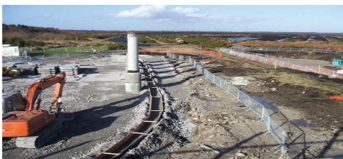
Bridge Structure 120 Bord Na Mona Railway